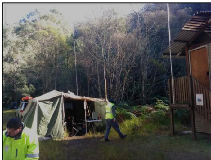
Home for the weekend

Sunday came and we packed away our gear checked over the site and returned back to the base camp to assist them with their gear and left to go home. It was a good weekend away and a learning experience for operating in the bush with limited resources. I am looking forward to the next event but hoping for a bit more sun.