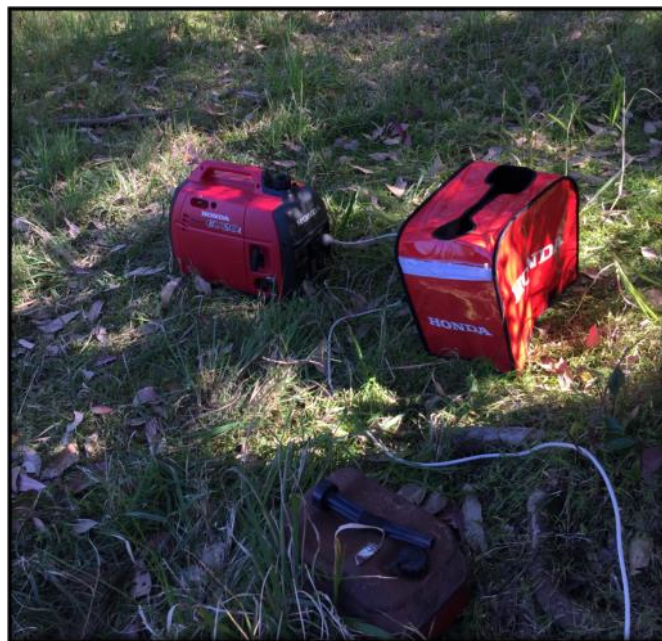
The generator ran quietly and flawlessly all weekend and just sipped fuel.

kindly donated this generator to the club last year.