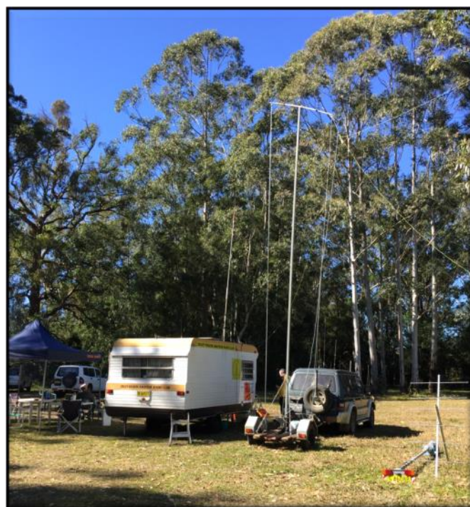
The impressive antenna set up.

Thank you to Lyle Smith VK2SMI for bringing his trailer mounted mast and HF antennas. The mast made it easy to erect the full size dipole antennas for 160, 80, 40 and 20 metres. The HF 5 band trap vertical on the caravan gave a choice of antenna polarization on most bands. Signals on both transmit and receive were consistently significantly better on the horizontal dipoles.