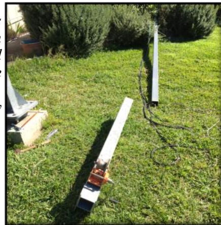
The cable lengths had been measured and they were of the right length, just, for the new location.

Once the mast was down, all antennas removed and the mast pulled to pieces for relocating, it was lunchtime. Stuart had the barbecue ready along with a huge bag full of king prawns, 2 different cold meats, salad and battered onion rings, no not bashed up, cooked in batter. What else could we do but down tool, only one, couldn't find anymore!, and head up to the feast. Funny it was the quickest I saw anyone move all day.