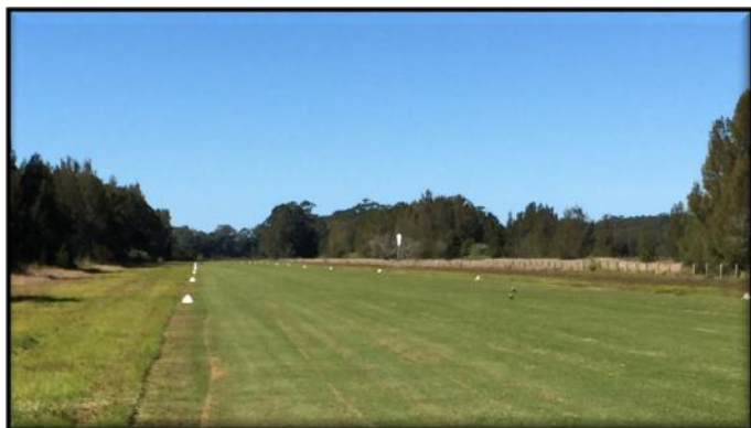
Camden Haven Airfield alongside the river bank.