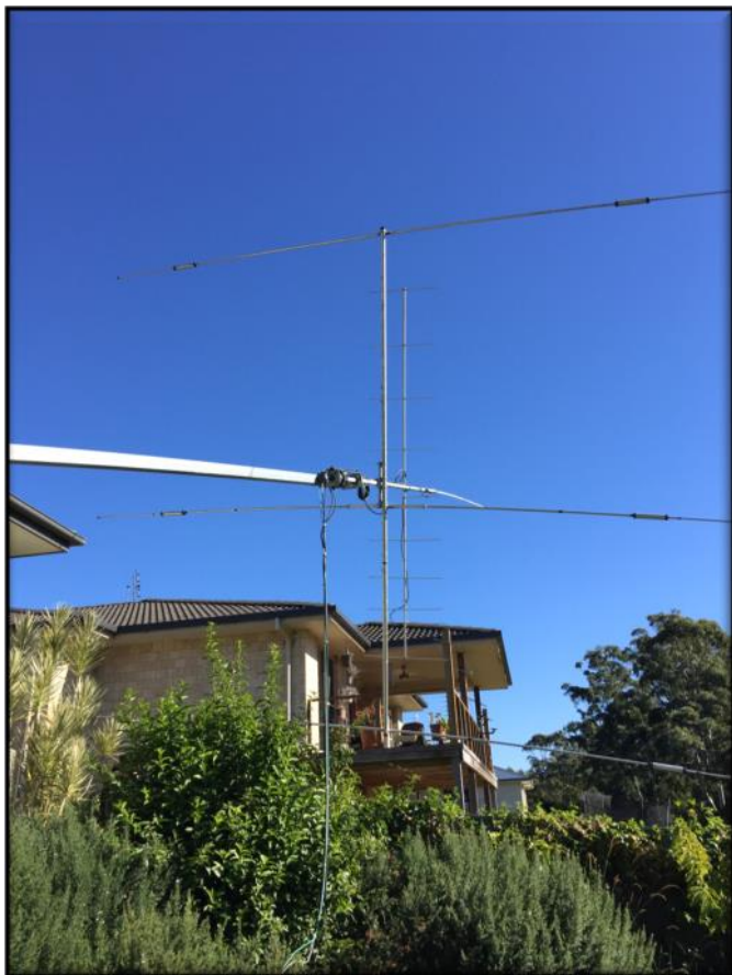
The mast tilted down ready for antennae removal.