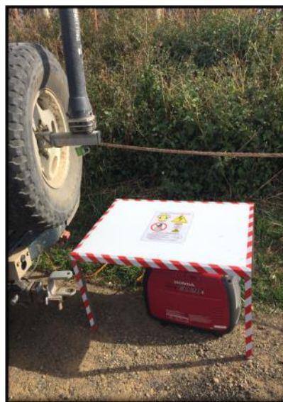
The generator with purpose made cover neatly tucked away behind 4WD.

The club's Honda EU20i inverter generator ran for the full day on a single tank of fuel and provided high quality AC power. The generator itself is very quiet, and with it placed under its cover between a couple of vehicles, it simply could not be heard over the wind.