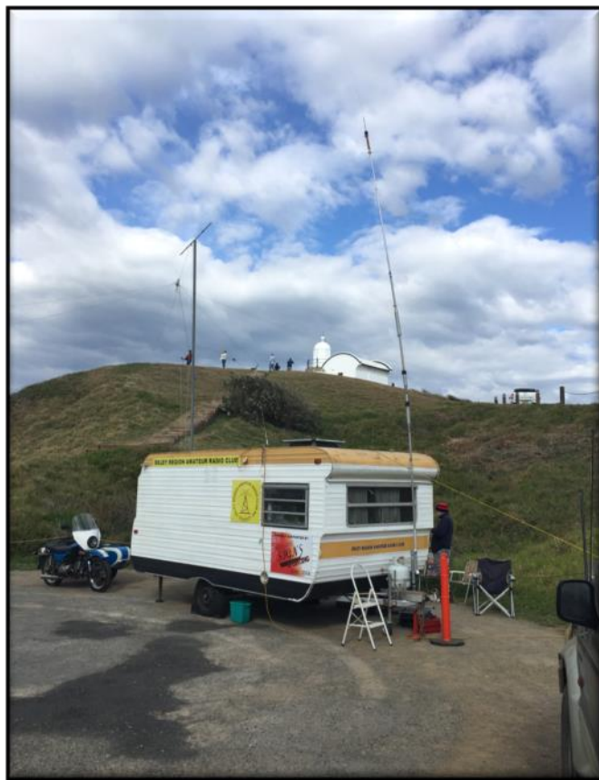
The strength of the wind can be gauged by looking at the club's vertical antenna which would bend and sway alarmingly in the wind gusts.

Lighthouse. That was the cue to pack up but fortunately it remained fine until everything was packed up and we departed after 4 pm.