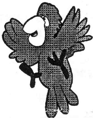
Proposed new voice repeater

It has been suggested that we fire up VK2RCN for a second digipeater channel for this area. Is this a solution or should we have better discipline on VK2RPM. Your comments (with workable solutions) would be appreciated."