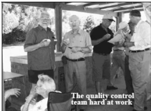
The quality control team hard at work

One two three four .....How many times should I turn them?