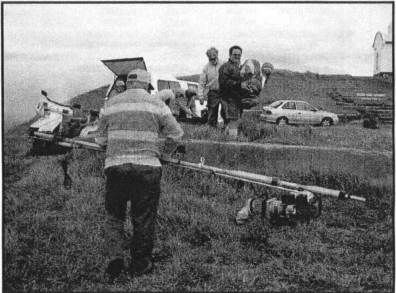
The crew, setting up shop at Tacking Point Lighthouse on Saturday 16th August.