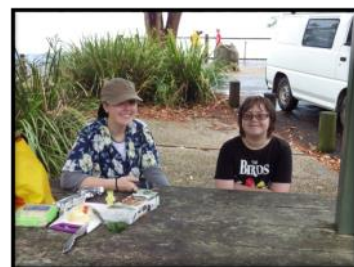
Harmonics enjoying the fresh air