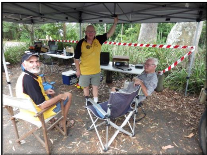
The two gazebos together made a large operating space for the stations.