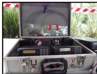
Another station in a case by Lyle VK2SMI