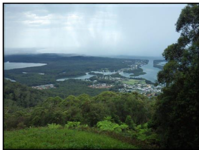
North Brothers magnificent views even in the wet. Below an intrepid group that includes Dave VK2AYD and Dennis VK2DAM with VK2FPDC family brave the wet.

North Brother Mountain is well elevated with excellent clear coastal paths to both the north and the south. The antennas all worked well but sadly, the hoped for 6 metre opening didn't materialize and no DX stations were heard on either 2 metres or 70 centimetres. As a result, VK2BOR did not have a score to submit.