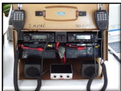
A double station in one case