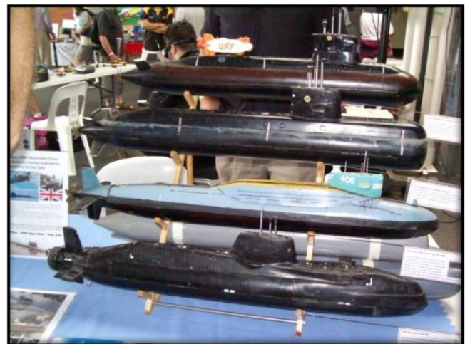
Model submarines radio controlled. (Editor wonders how they are tracked when out of sight submerged.)

With some of the major traders absent, those traders who did attend reported brisk business. This year model traders offering quadcopters and submarines made their debut and created a lot of interest. Traders included VK4ICE, Roda Antennas, FPV, Radio Supply Limited, RF Solutions, Cro-tek Instruments, TET-Emtron, Spark CC, Duro Services and Oatley Electronics.