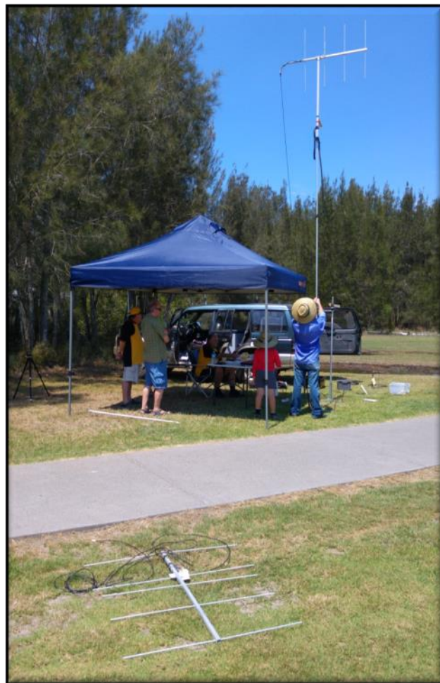
Antennas being set up for testing.