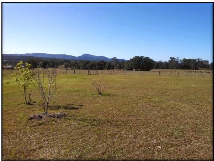
Larry's farm a very scenic location

The Remembrance Day Contest was held at the farm of Larry Lindsay VK2CLL.