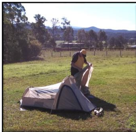
Real amateurs sleep in tents!