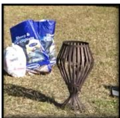
Please see page 8 of this issue for additional photographs of the weekend.