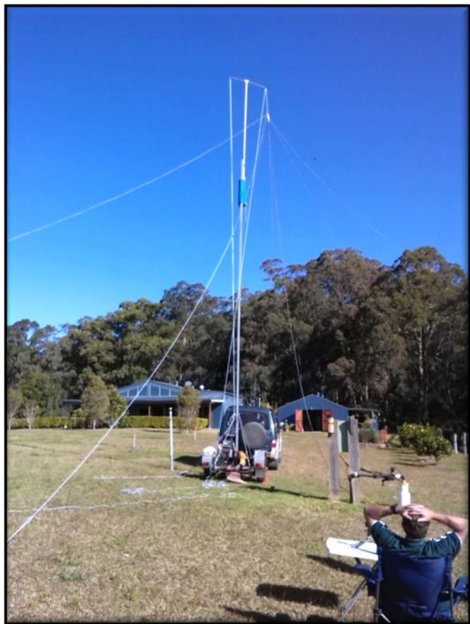
Trailer mast deployed and ready for action.

Now where was I, something about a contest, oh yes, we had a break then back to work. Something like an hour later we finished erecting the trailer mast and aerials. I mean that was surely coffee time, so Larry, again to the rescue, made brewed coffee and supplied a variety of home-made cakes and biscuits, we needed the sustenance if we were to get on air and slave over a hot radio.