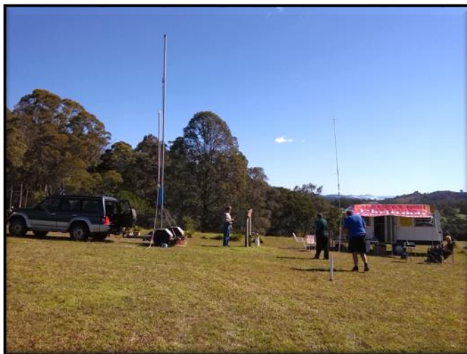
Larry VK2CLL's farm site perfect weather; extensive views and a good HF operating location.

club to set up the cub's communications caravan and operate VK2BOR in the Remembrance Day contest at his new property at Huntingdon on Saturday and Sunday the 13 th and 14 th of August 2016. This proved to be an excellent HF location in very pleasant surrounds and is located only a short distance west of Wauchope.