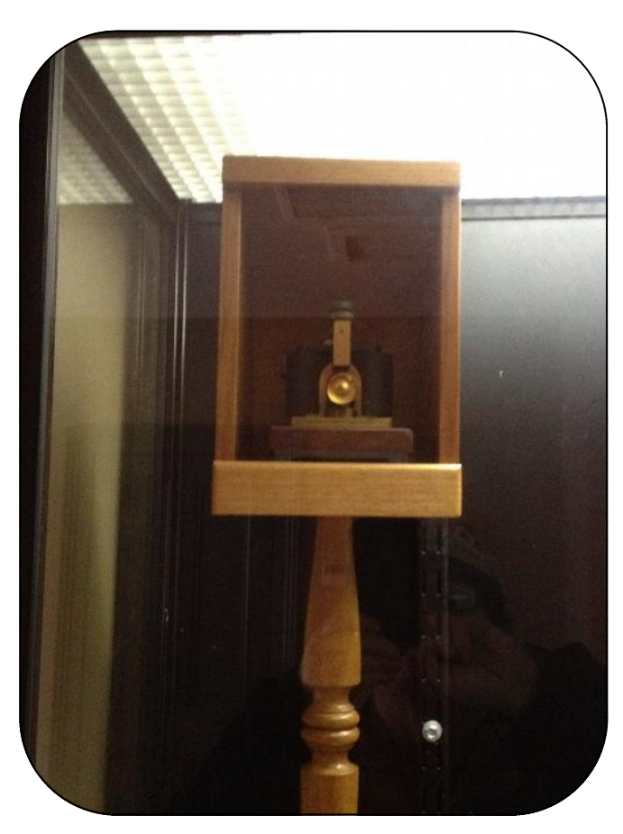
A sounder box similar to the ones used at the telegraph station at Cape Otway.

Editors note: I have talked to telegraph operators and they said that usually there is no problem in transferring the skills to reading radio mores of dots and dashes however its much harder transferring the skills the other way.