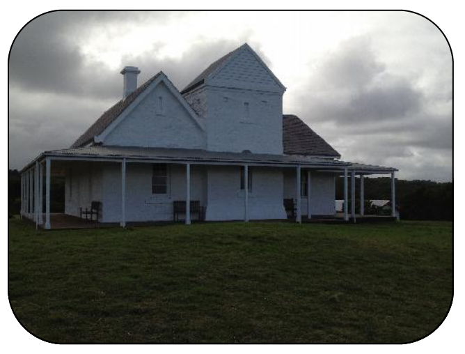
Cape Otway signal station restored today

The first telegraph lines around Melbourne 1854 and Adelaide 1856 joined in July 1858 and were then linked to Sydney in October 1858. Hobart and Launceston were linked in 1857 and Tasmanians were very keen for a direct link with the mainland. In 1859 the submarine cable across Bass Strait was the longest laid anywhere in the world.