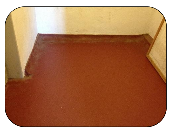
The battery room at the signal station. Note the bathtub like floor to help contain sulphuric acid spills.

Electricity from sulphuric acid batteries powered the telegraph. A steady, reliable source of electric power was needed for the telegraph and in the 19th century batteries were the only choice for stations such as Cape Otway. Telegraphy over hundreds of kilometres required a large bank of cells to build up enough voltage to overcome losses from leakage and resistance.