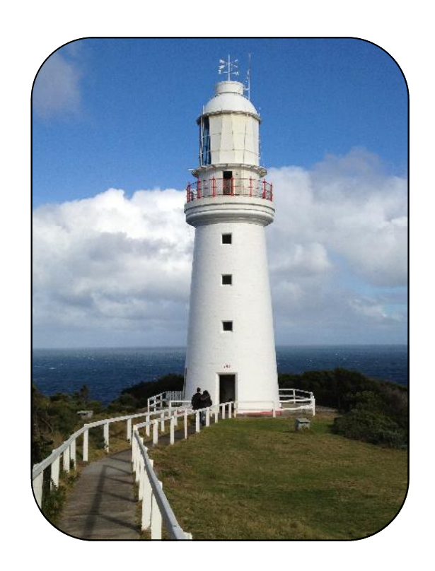
Cape Otway Light Station

referred to Melbourne for arbitration. Considering that the location was quite isolated and a considerable distance from the nearest settlement this must have led to some extremely strained living relationships!