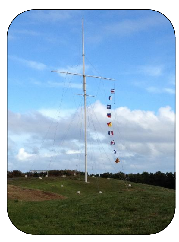
Signalling by flags at Cape Otway

This article compiled from material presented on information boards within the Cape Otway National Park.