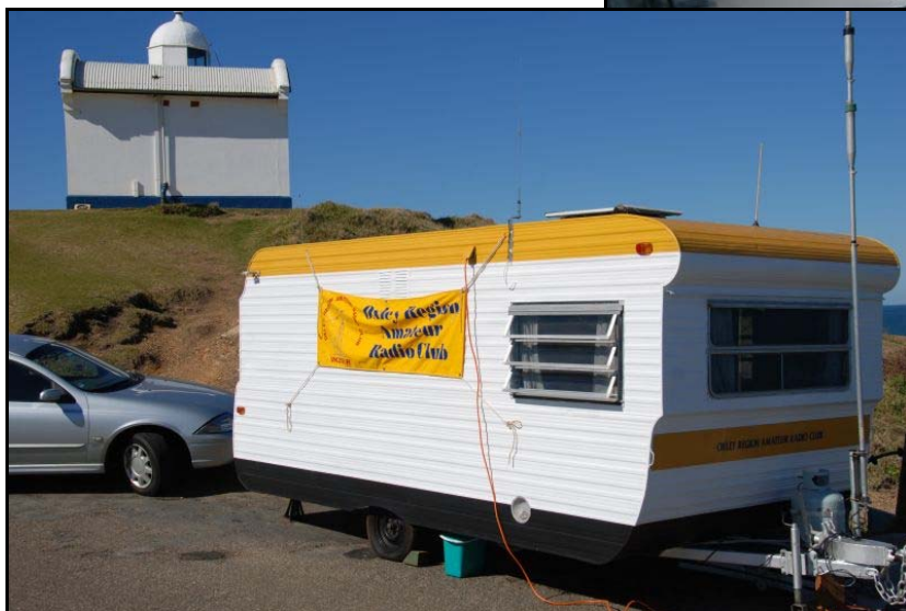
Left: The club's caravan on site at Tacking Point Lighthouse