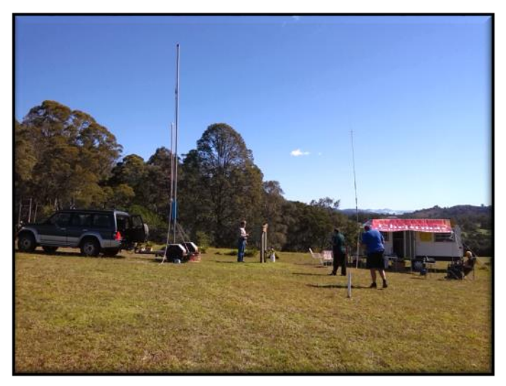
Larry VK2CLL's farm site perfect weather; extensive views and a good HF operating location.

club to set up the cub's communications caravan and operate VK2BOR in the Remembrance Day contest at his new property at Huntingdon on Saturday and Sunday the 13<sup>th</sup> and 14<sup>th</sup> of August 2016. This proved to be an excellent HF location in very pleasant surrounds and is located only a short distance west of Wauchope.