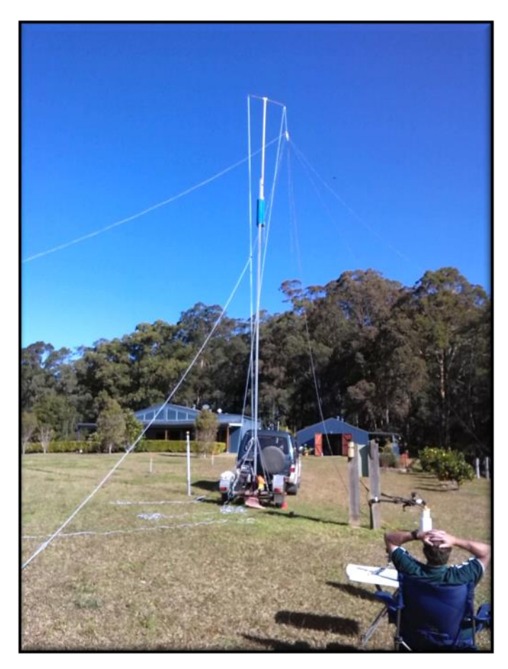
Trailer mast deployed and ready for action.

Now where was I, something about a contest, oh yes, we had a break then back to work. Something like an hour later we finished erecting the trailer mast and aerials. I mean that was surely coffee time, so Larry, again to the rescue, made brewed coffee and supplied a variety of home-made cakes and biscuits, we needed the sustenance if we were to get on air and slave over a hot radio.