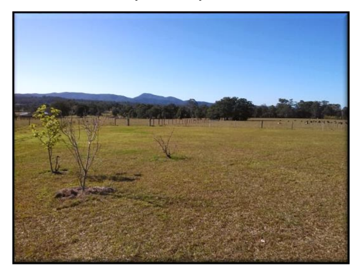
Larry's farm a very scenic location

The Remembrance Day Contest was held at the farm of Larry Lindsay VK2CLL.