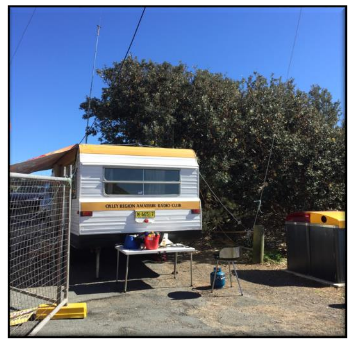
Note narrow pathway around the caravan on the way to the beach; however the general public did not seem to mind.

A few members of the public, fishing rods and all, walked under the caravan annexe on their way to and from the Little Bay beach below the car park!