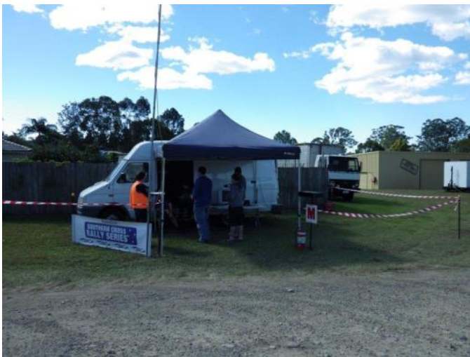
Rally Head Quarters Service Park entrance above and work site below