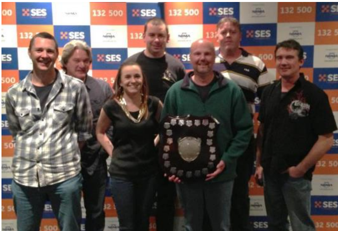
A winning SES team

Congratulations to all the team on a great victory. We wish them well in the national competition.