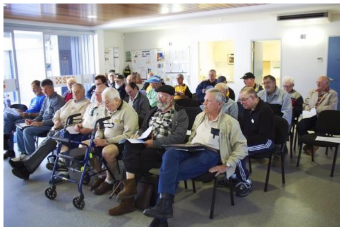
AGM of ORARC the members decide