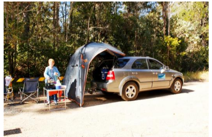
Leonie VK2LPN boils the billy.